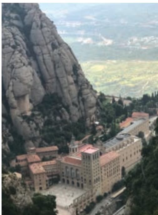
Santa Maria de Montserrat, located on the mountain of Montserrat in Monistrol de Montserrat, Catalonia, Spain, was founded in the 11th century. More than 1,000 years later, the monastery continues to thrive with over 70 Benedictine monks in residence.

THE BOARD OF REGENTS PLANS FOR THE FUTURE, AND THE PILGRIMS AMONG THEM REFLECT UPON A FOUNDATION LAID 500 YEARS AGO.